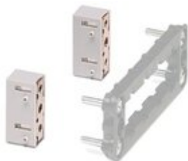
Panel mounting flange for screw locking, for mounting contact insert modules, for a panel thickness of 1 - 5 mm

Please be informed that the data shown in this PDF Document is generated from our Online Catalog. Please find the complete data in the user's documentation. Our General Terms of Use for Downloads are valid ( http://phoenixcontact.com/download )