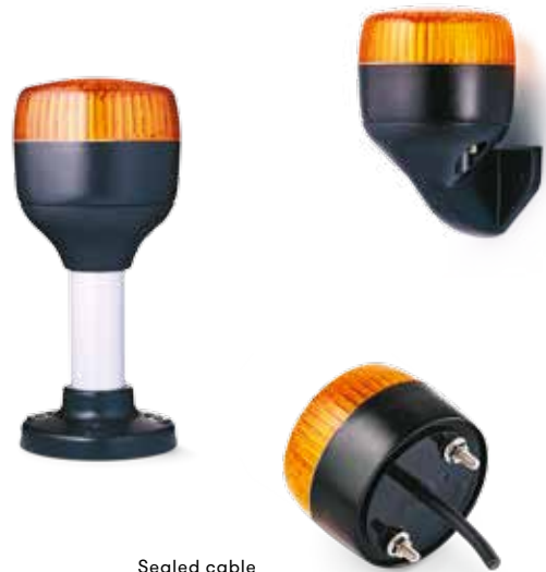
Sealed cable insulation/entry