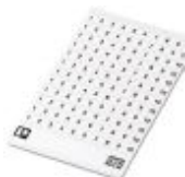
Marker card, Card, can be ordered: by card, white, labeled according to customer specifications, mounting type: adhesive, for terminal block width: 4.15 mm, lettering field size: continuous x 3.8#mm

Marker card - SK 3,8 REEL P4,15 WH CUS - 0825990