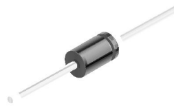
DO-41 Glass case COLOR BAND DENOTES CATHODE