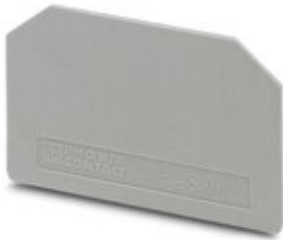
End cover, length: 46 mm, width: 1 mm, height: 28.7 mm, color: gray

Please be informed that the data shown in this PDF Document is generated from our Online Catalog. Please find the complete data in the user's documentation. Our General Terms of Use for Downloads are valid ( http://phoenixcontact.com/download )