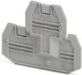
End cover, length: 69.9 mm, width: 2.2 mm, height: 57.5 mm, color: gray

Please be informed that the data shown in this PDF Document is generated from our Online Catalog. Please find the complete data in the user's documentation. Our General Terms of Use for Downloads are valid ( http://phoenixcontact.com/download )