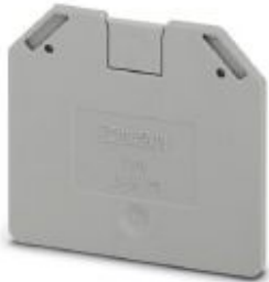
End cover, length: 52.8 mm, width: 2.2 mm, height: 47.3 mm, color: gray

Please be informed that the data shown in this PDF Document is generated from our Online Catalog. Please find the complete data in the user's documentation. Our General Terms of Use for Downloads are valid ( http://phoenixcontact.com/download )