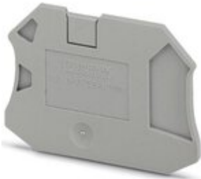
End cover, length: 56.8 mm, width: 2.2 mm, height: 39.8 mm, color: gray

Please be informed that the data shown in this PDF Document is generated from our Online Catalog. Please find the complete data in the user's documentation. Our General Terms of Use for Downloads are valid ( http://phoenixcontact.com/download )