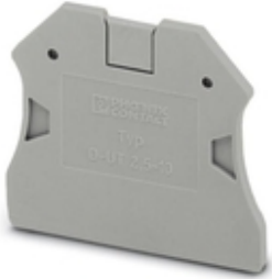
End cover, length: 47 mm, width: 2.2 mm, height: 39.8 mm, color: gray

Please be informed that the data shown in this PDF Document is generated from our Online Catalog. Please find the complete data in the user's documentation. Our General Terms of Use for Downloads are valid ( http://phoenixcontact.com/download )