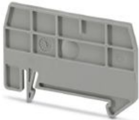
Partition plate, length: 59.8 mm, width: 2 mm, height: 39 mm, color: gray

Please be informed that the data shown in this PDF Document is generated from our Online Catalog. Please find the complete data in the user's documentation. Our General Terms of Use for Downloads are valid ( http://phoenixcontact.com/download )