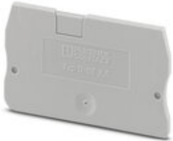
End cover, length: 48.6 mm, width: 2.2 mm, height: 29.1 mm, color: gray

Please be informed that the data shown in this PDF Document is generated from our Online Catalog. Please find the complete data in the user's documentation. Our General Terms of Use for Downloads are valid ( http://phoenixcontact.com/download )