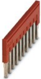
Plug-in bridge, pitch: 5.2 mm, color: red

Please be informed that the data shown in this PDF Document is generated from our Online Catalog. Please find the complete data in the user's documentation. Our General Terms of Use for Downloads are valid ( http://phoenixcontact.com/download )