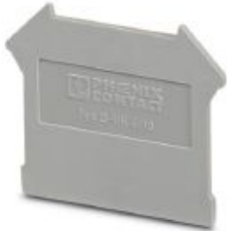
End cover, length: 42.5 mm, width: 1.8 mm, height: 35.9 mm, color: gray

Please be informed that the data shown in this PDF Document is generated from our Online Catalog. Please find the complete data in the user's documentation. Our General Terms of Use for Downloads are valid ( http://phoenixcontact.com/download )