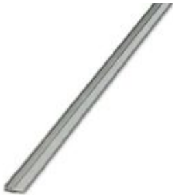
Continuous plug-in bridge, length: 500 mm, color: gray

Please be informed that the data shown in this PDF Document is generated from our Online Catalog. Please find the complete data in the user's documentation. Our General Terms of Use for Downloads are valid ( http://phoenixcontact.com/download )