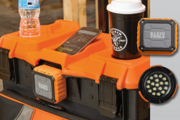
Twist-lock the Klein LED Light (55437) or Wireless Speaker (AEPJS1) on front mount (items sold separately)