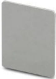
Separating plate, length: 14 mm, width: 0.5 mm, height: 16 mm, color: gray

Please be informed that the data shown in this PDF Document is generated from our Online Catalog. Please find the complete data in the user's documentation. Our General Terms of Use for Downloads are valid ( http://phoenixcontact.com/download )