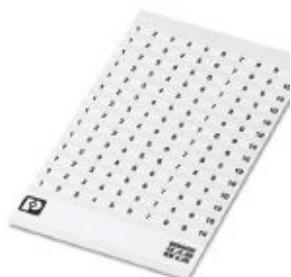
Marker card, self-adhesive, horizontally labeled with the consecutive numbers: 1 ... 10, 10-section marker strips with 14 identical decades, white

Please be informed that the data shown in this PDF Document is generated from our Online Catalog. Please find the complete data in the user's documentation. Our General Terms of Use for Downloads are valid ( http://phoenixcontact.com/download )