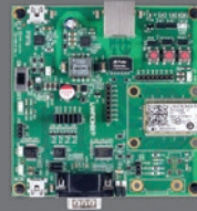
xPico 110 Evaluation Board