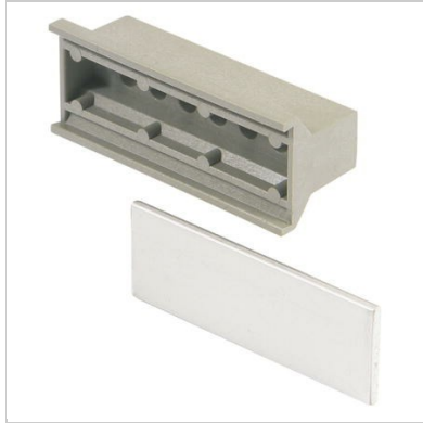
Illustration shows handle, 8 HP, grey