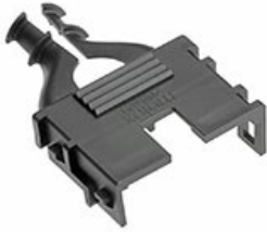
Series image - Reference only

Mini-Fit Jr. Hermaphroditic Backshell, 6 Circuits, Low-Halogen, Black