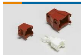
Rectangular Boots & Strain Relief (2)