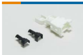
Rectangular Backshells & Clamps (2)