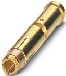
Crimp contact, turned, contact diameter: 2 mm, crimp range: 1.5 mm 2 ... 2.5 mm 2

Please be informed that the data shown in this PDF Document is generated from our Online Catalog. Please find the complete data in the user's documentation. Our General Terms of Use for Downloads are valid ( http://phoenixcontact.com/download )