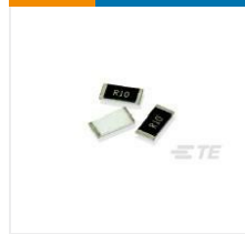
RLP73M 1J R068 5% 5K RL RLP73M1JR068JTD