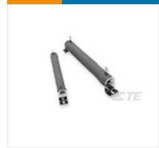
TE 2000W 8R2 5% Bracket TE2000B8R2J