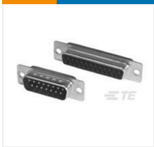
9 Plug Solder Cup, 30 gold, Ro 5-747904-5