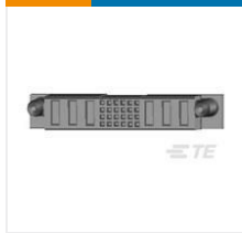
MBXL VERT RCPT 3P+24S+3P 1-6450140-0