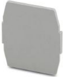
Separating plate, length: 22 mm, width: 0.5 mm, height: 22 mm, color: gray

Please be informed that the data shown in this PDF Document is generated from our Online Catalog. Please find the complete data in the user's documentation. Our General Terms of Use for Downloads are valid ( http://phoenixcontact.com/download )