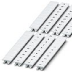
Zack marker strip, 10-section, horizontally labeled with the consecutive numbers: 1 ... 10, white, width: 8 mm

Please be informed that the data shown in this PDF Document is generated from our Online Catalog. Please find the complete data in the user's documentation. Our General Terms of Use for Downloads are valid ( http://phoenixcontact.com/download )