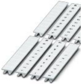
Zack marker strip, 10-section, horizontally labeled with the consecutive numbers: 61 ... 70, white, width: 5 mm

Please be informed that the data shown in this PDF Document is generated from our Online Catalog. Please find the complete data in the user's documentation. Our General Terms of Use for Downloads are valid ( http://phoenixcontact.com/download )