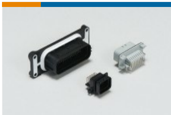
Automotive, Truck, Bus, & Off-Road Headers (6)