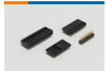
Multiple Configuration PCB Connector Housings (3)