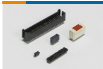
Board-to-Board Headers & Receptacles (1571)