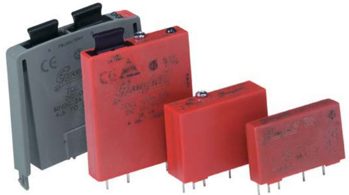
70L-ODC5R 70G-ODCR/OACRLY 70-ODCR/OACRLY 70M-ODCR