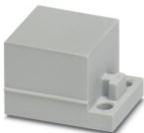
Small blind sleeve, material: SEBS

Please be informed that the data shown in this PDF Document is generated from our Online Catalog. Please find the complete data in the user's documentation. Our General Terms of Use for Downloads are valid ( http://phoenixcontact.com/download )