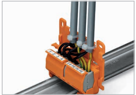
Vertical mounting with strain relief plate on DIN 35 rail. Marking clamping units via marker strips.