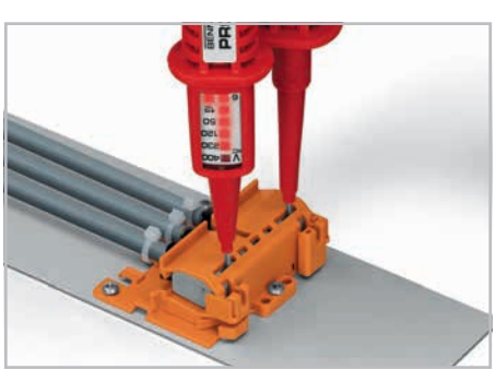
Testing connectors via test slots on top of the carrier.