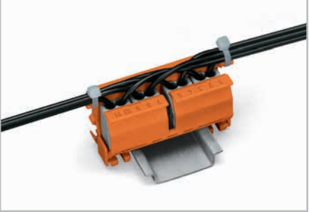
Strain relief by cable tie on the carrier, transverse to the connector's wiring direction. Molded marking clamping units.