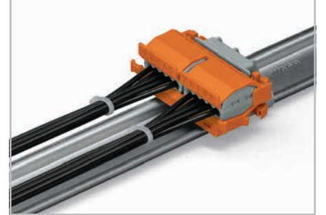
Horizontal mounting on DIN 35 rail using angled DINrail adapter.