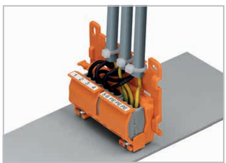
Mounting carrier with strain relief plate mounted vertically on a plate. Round cable fixed via strain relief lug.