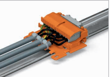
Horizontal mounting with strain relief plate on DIN 35 rail using angled DIN-rail adapter.