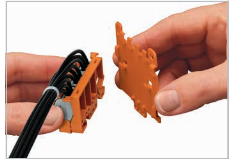
Mounting of strain relief plate to the mounting carrier.