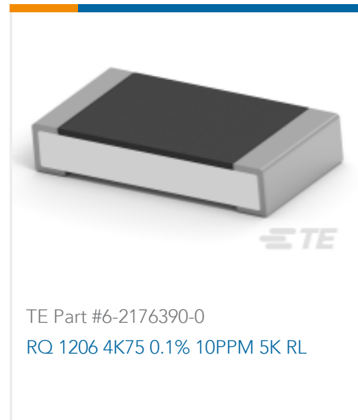
TE Part #6-2176390-0 RQ 1206 4K75 0.1% 10PPM 5K RL