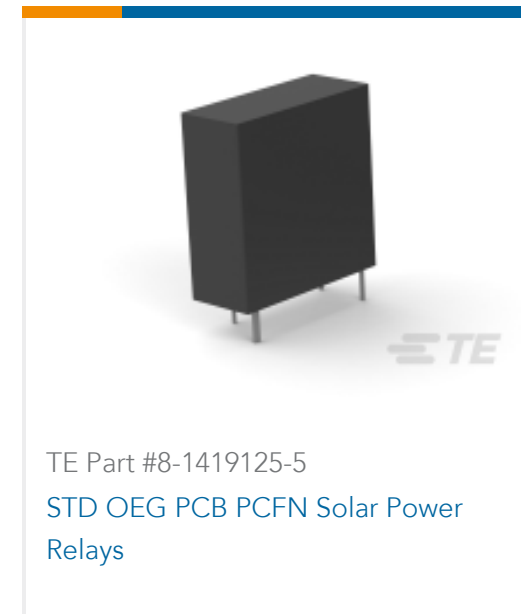
TE Part #8-1419125-5 STD OEG PCB PCFN Solar Power Relays