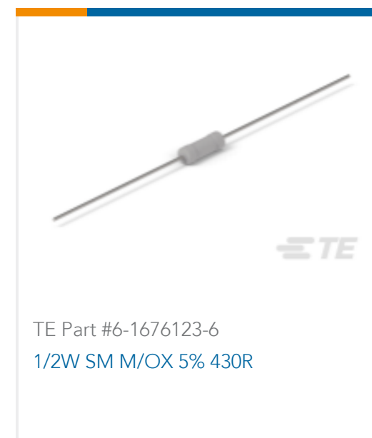
TE Part #6-1676123-6 1/2W SM M/OX 5% 430R