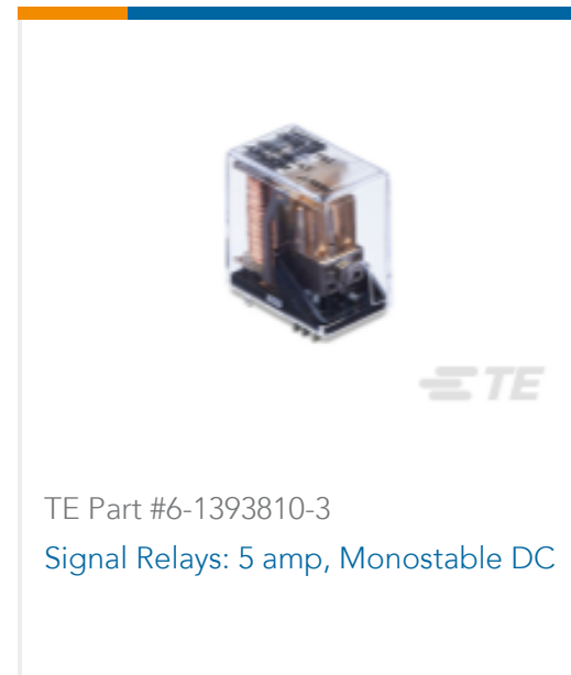
TE Part #6-1393810-3 Signal Relays: 5 amp, Monostable DC