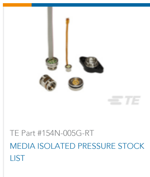
TE Part #154N-005G-RT MEDIA ISOLATED PRESSURE STOCK LIST