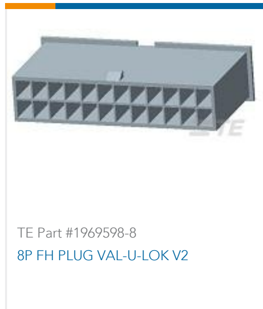
TE Part #1969598-8 8P FH PLUG VAL-U-LOK V2