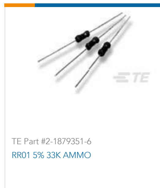
TE Part #2-1879351-6 RR01 5% 33K AMMO