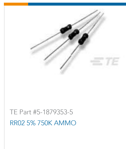
TE Part #5-1879353-5 RR02 5% 750K AMMO