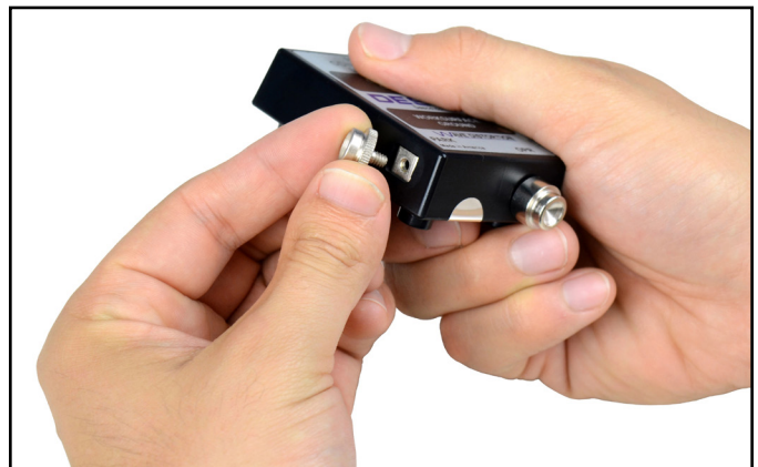
Figure 7. Changing the park snap on the 19243 Mini Monitor

The 19243 Mini Monitor includes an interchangeable 10mm park snap and 10mm banana jack adapter for operators who use wrist cords with 10mm terminations. Use the park snaps' knurled rims to unscrew the 4mm park snap from the monitor and install the 10mm park snap to the monitor. Plug the 10mm operator jack adapter into the monitor's operator jack.