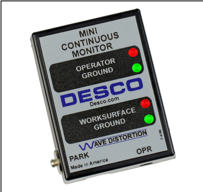
Figure 1. Desco Mini Monitor