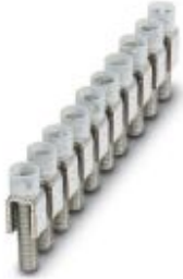
Fixed bridge, pitch: 8 mm, number of positions: 10, color: silver

Please be informed that the data shown in this PDF Document is generated from our Online Catalog. Please find the complete data in the user's documentation. Our General Terms of Use for Downloads are valid ( http://phoenixcontact.com/download )