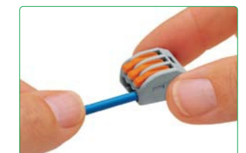
3) Insert Conductor And Push Down Lever