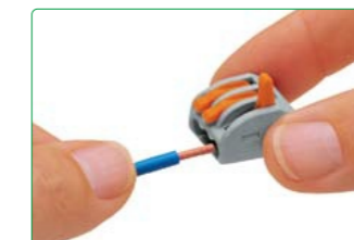
2) Push Up Lever