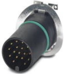
Flush-type connector, 17-position, Plug, Link: straight, Link: M12, A-coded, PCB mounting, SMD

Please be informed that the data shown in this PDF Document is generated from our Online Catalog. Please find the complete data in the user's documentation. Our General Terms of Use for Downloads are valid ( http://phoenixcontact.com/download )