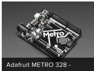
Adafruit METRO 328