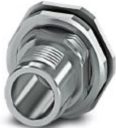
Housing screw connection, Plug, M12-SPEEDCON, Rear mounting, M15 x 1

Please be informed that the data shown in this PDF Document is generated from our Online Catalog. Please find the complete data in the user's documentation. Our General Terms of Use for Downloads are valid ( http://phoenixcontact.com/download )