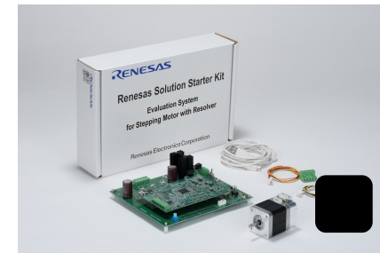
Evaluation System for Stepping Motor with Resolver