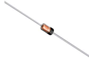
DO-35 Hermetically Sealed Glass