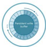
Continuous Ring Buffers