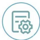
Boot Load Configuration