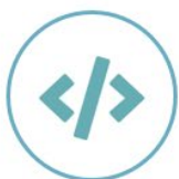
Code Storage & Execution (+XIP)