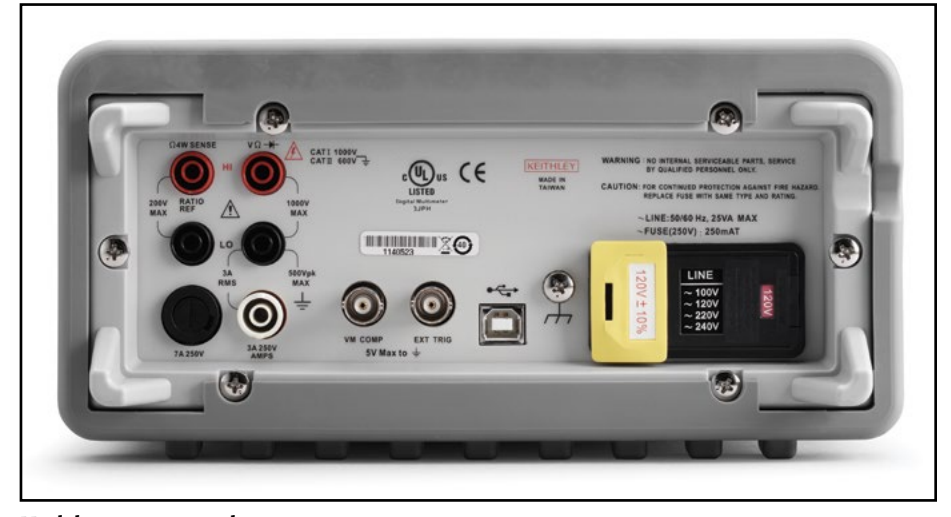
Model 2100 rear panel