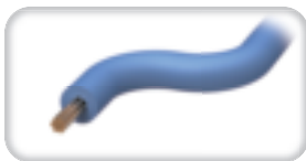
Raw Discrete Wire (Stripped)

A typical crimp type wire-to-board interconnect solution requires four components. First a raw discrete wire, which is stripped, and then a crimp type contact is crimped onto the wire. The contact and wire are then inserted into an unloaded receptacle housing, which is mated with a header that is terminated to a PCB either through hole (DIP) or SMT style.