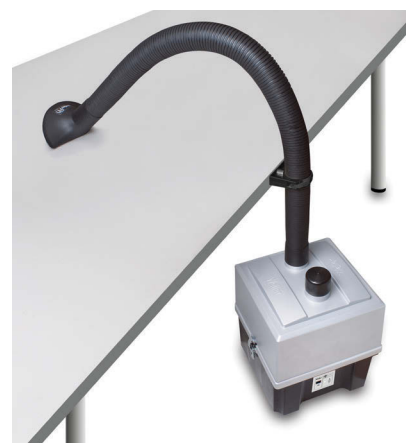
> Zero Smog EL unit