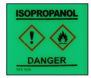
Note: Printed bottles eliminate the need for additional labels custom printing available.