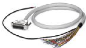
The figure shows the 25-pos. version

Shielded cable with a 9-pos. D-SUB female connector and one open end. The individual wires are labeled 1 to 9 and fitted with ferrules. The braided shield is routed to a separate cable end. Cable length: 6 m.