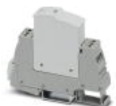
Type 3 surge protection, consisting of protective plug and base element, with integrated status indicator and remote signaling for single-phase power supply networks. Nominal voltage 24 V AC/DC.

Type 3 surge protection device - PLT-SEC-T3-24-FM-UT - 2907916