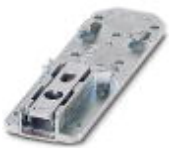
Universal DIN rail adapter

Assembly adapters - UTA 107/30 - 2320089