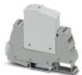
Type 2/3 surge protection, consisting of protective plug and base element, with integrated status indicator and remote signaling for single-phase power supply networks. Nominal voltage 230 V AC/DC.

Type 3 surge protection device - PLT-SEC-T3-230-FM-UT - 2907919