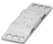
Universal wall adapter for securely mounting the power supply in the event of strong vibrations. The power supply is screwed directly onto the mounting surface. The universal wall adapter is attached at the top/bottom.

Assembly adapters - UWA 182/52 - 2938235