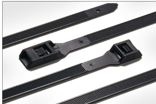
Low profile cable tie, RPE / PE-Series.