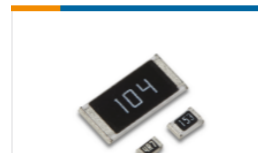
TE Part #2-2176343-3 CRGCQ 1206 680R 1%