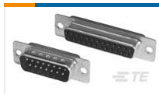
TE Part #5-747916-2 37 Plug Solder Cup, Gold Flash