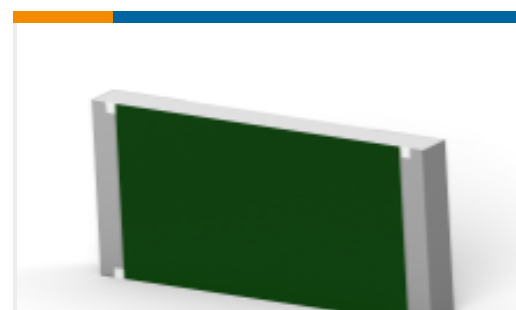
TE Part #6-2176403-0 3550 300R 1%