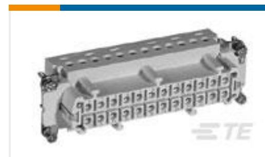
TE Part #1-1103641-1 HE.24.BU.S.1-24