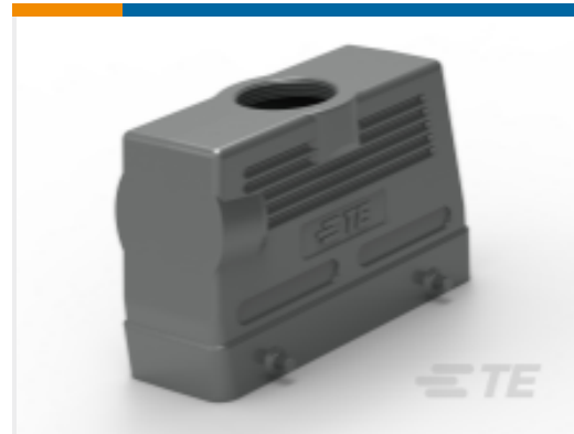
TE Part #T1240240121-000 H24B-TGH-PG21