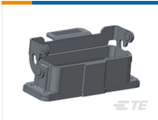
TE Part #T1509161000-000 H16A-AGS