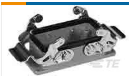
TE Part #1-1102291-1 HB.24.AG-VS