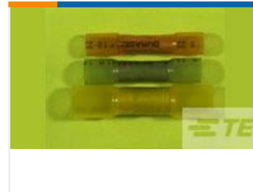
TE Part #CC2619-000 D-406-0001CS100