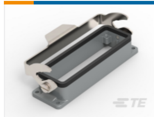
TE Part #T1500243000-000 H24B-AG-LB