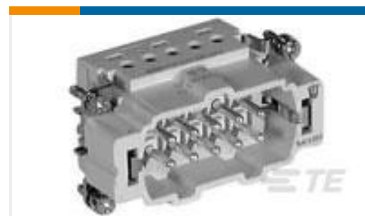
TE Part #1-1103636-1 HE.10.STI.S