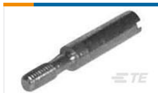
TE Part #1-1106100-1 SPB-M3