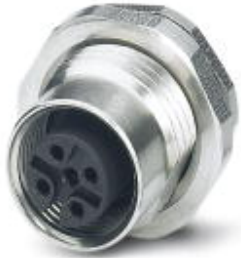
Flush-type connector, 4-position, SocketLink:straightLink:M12, A-coded, Rear mounting, Pg9, Solder pins

Please be informed that the data shown in this PDF Document is generated from our Online Catalog. Please find the complete data in the user's documentation. Our General Terms of Use for Downloads are valid ( http://phoenixcontact.com/download )